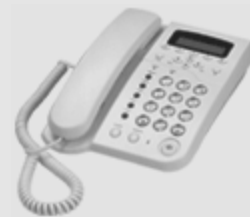
SiPTel C01 Dialup + Ethernet IP Phone

ISP's / ITSP can configure SiPTel C01 IP Phone to their own Gatekeeper and expand their market reach beyond PC users and unveil a whole new business opportunity.